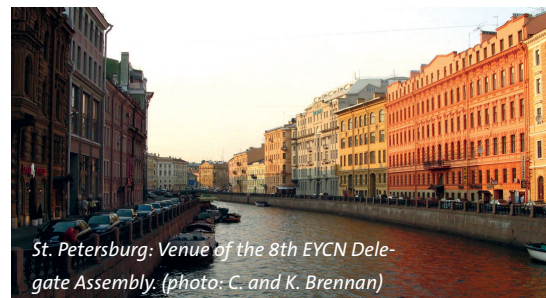
St. Petersburg: Venue of the 8th EYCN Delegates Assembly.