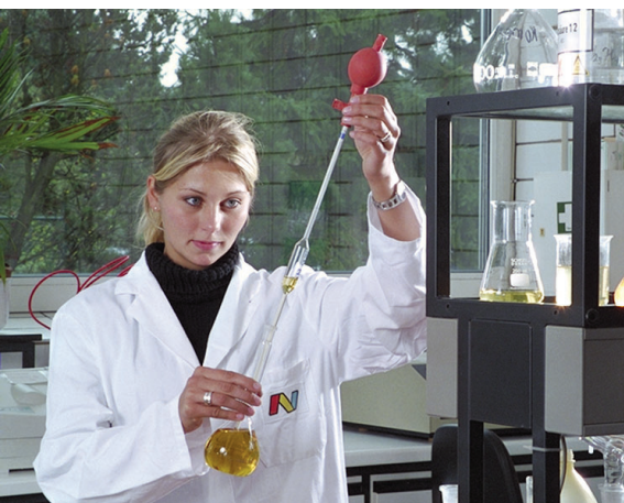
Working in the lab: Mismatch between industry requirements and taught courses.

Two thirds of chemical companies currently have difficulty in filling vacancies. Some shortages arise from a mismatch between the requirements of industry and taught courses, e.g. academia focuses on synthetic chemistry but 40 percent of EU chemical production involves formulation chemistry.