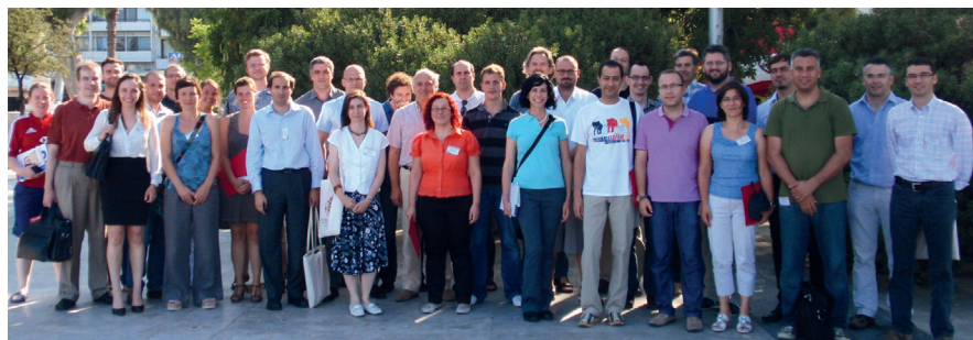
Participants of the Young Investigators Workshop.